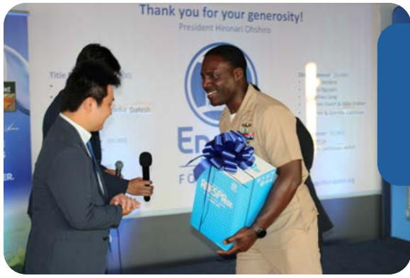
This lucky serviceman won an Anespa DX during the event raffle.