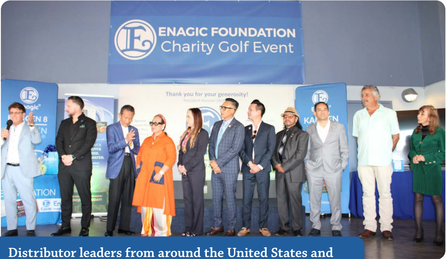
Distributor leaders from around the United States and Canada sponsored the event with significant donations.