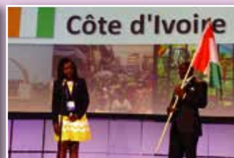
Côte d'Ivoire 科特迪瓦