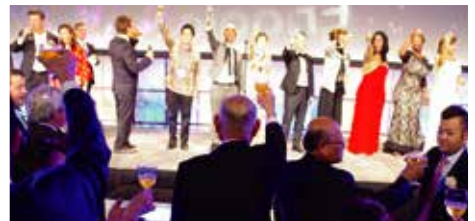
A toast was lead by 6A2-4 (and above) distributors. 6A2-4(及以上)的分銷商一同祝酒