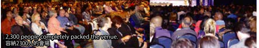
2,300 people completely packed the venue. 容納2300人的會場