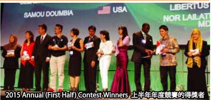
2015 Annual (First Half) Contest Winners 上半年年度競賽的得獎者