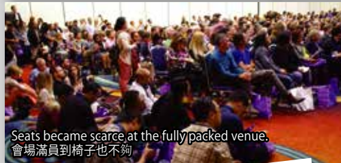
Seats became scarce at the fully packed venue. 會場滿員到椅子也不夠