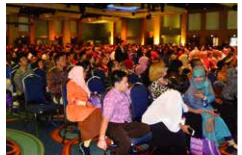
The venue packed with participants. 會場內水洩不通的參加者