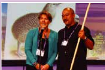
New Zealand 新西蘭