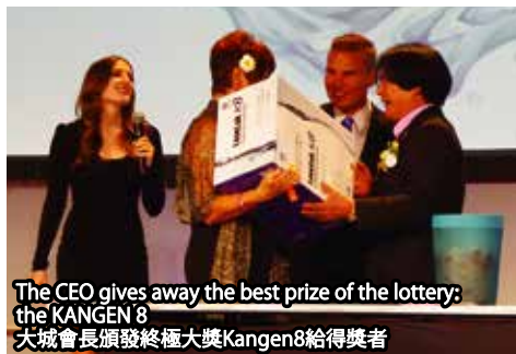
The CEO gives away the best prize of the lottery: the KANGEN 8 大城會長頒發終極大獎Kangen8給得獎者