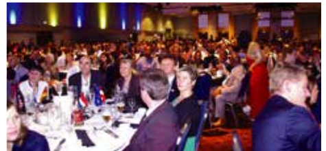
The party venue was filled with people. 觀眾擠滿整個會場