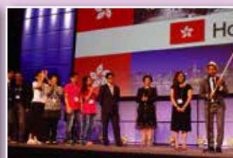
Hong Kong 香港