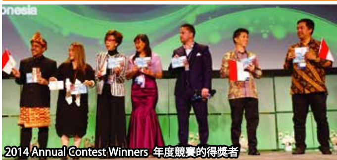
2014 Annual Contest Winners 年度競賽的得獎者