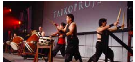
The party opened up with the powerful wadaiko performance. 充滿力量的太鼓表演為晚宴掀開序幕