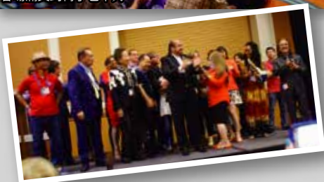
Top distributors gathered from around the world. 由世界各地而來的頂級分銷商