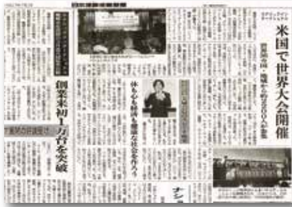
The convention featured in a newspaper (released July 2) 7月2日被報紙刊登的大會議題

A journalist from the "Nihon Ryutsu Sangyo Shinbun," Japan Distribution Industry Newspaper, covered the Global Convention in Anaheim held from June 11-13. The largely featured article, titled "Global Convention