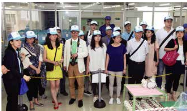
The Hong Kong Team checking out the assembly department. 參觀裝配部門的香港隊伍組員

6月的Enagic全球會議的前後期間，一部分的參加者到了大阪工廠參觀。8日是馬來西亞隊伍，16日是香港隊伍，工廠的最新生產系統使參觀者都感到工廠規模非常壯觀。