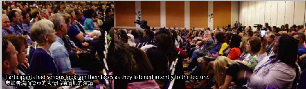
Participants had serious looks on their faces as they listened intently to the lecture. 參加者滿面認真的表情聆聽講師的演講