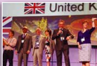
United Kingdom 英國