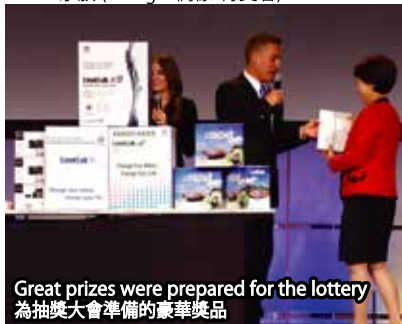
Great prizes were prepared for the lottery 為抽獎大會準備的豪華獎品