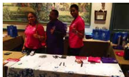
Related goods were also popular at the event. 相關的商品也很受活動歡迎