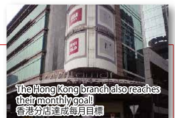
The Hong Kong branch also reaches their monthly goal! 香港分店達成每月目標

Hawaii / 夏威夷, New York / 紐約, Vancouver / 溫哥華, Brazil / 巴西, Hong Kong / 香港, Indonesia / 印尼, Philippines / 菲律賓 and Okinawa / 沖繩