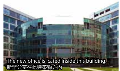
The new office is located inside this building. 新辦公室在此建築物之內

最近在莫斯科的俄羅斯辦公室，續努力。請大家可以多加利用，新住址如右。搬遷之同一市區內的另一個地方。讓所有的工作人員一同在新的辦公室繼