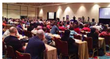
400 "students" attended the "university." 「大學」有400「學生」出席

這個活動有另外一個名字「還元大學」，上面提到的分銷商把「學生」聚集起來，進行了講座和訓練。這兩天中，通過講義，把正確的溝通方式、商品和計畫的正確知識傳達給「學生」，對許多分銷商來說，都是非常珍貴的經驗。