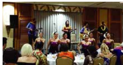
The ukulele and hula performance livened up the ceremony. 烏克麗麗和草裙舞表演令頒獎典禮增色不少