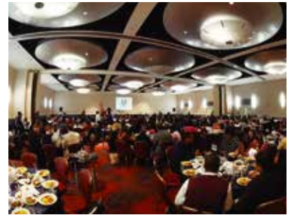
400 people celebrate the new branch office 400人慶祝新分店開幕

10月23日，被漢德森河所包圍，也是之前的兩倍以上。實際的新辦公室開幕是在明年的1月份，讓我們一起期待更大更方便利用的新辦公室吧！