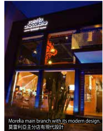
Morelia main branch with its modern design. 莫雷利亞主分店有現代設計

Address: Av. Ventura Puente 1641 Col. Electricistas 58290 Morelia, Michoacan Phone: +52 443 3146905 www.vainillachocolate.mx