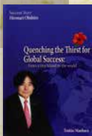
"Quenching Thirst for Global Success"

Other major works by the author: "The Rules of Business Taught by the Bible" / "Quenching the Thirst for Global Success"