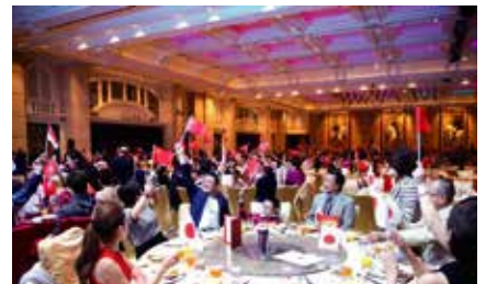
The largest group of the China team waving their flag. 搖動國旗數量最多的是中國團隊