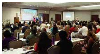
The venue was filled with participants. 參與者坐滿整個會場

大家都非常的踴躍的參加並學習由領導人說主講的訓練。在第二天的晚宴中，由非常有夏威夷味道由烏克麗麗伴奏的草裙舞表演來炒熱氣氛，之後的頒獎儀式中，得獎者都非常的開心，向大家分享他們的喜悅。