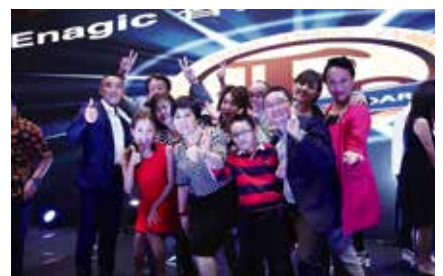
Team Japan also joined in on the celebration. 日本團隊參與10週年慶典

On October 10, Enagic Hong Kong's 10 year anniversary celebration was held in Shenzhen, Guangdong, which is situated next to Hong Kong and is one of the most successful Special Economic Zones. Over 1,000 distributors gathered at the hotel venue, many of which were from Hong Kong and China while others traveled from Japan and Southeast Asia.