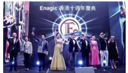
Asia's top leaders proposing the toast. 亞洲頂級領袖舉杯祝酒