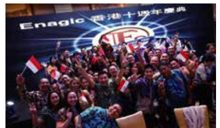
The vibrant Indonesia team. 充滿活力的印尼團隊