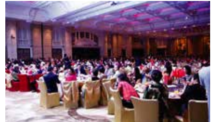
The venue overflowed with over 1,000 people. 會場擠滿1000人