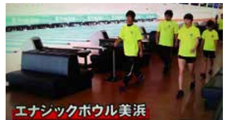
Academy students on their way to practice. 學院學生在他們的方法來練習

(all photos are shots from the TV/所有圖片從電視截圖)