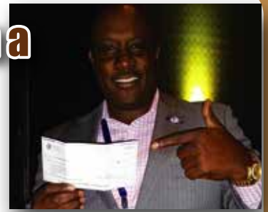
Proud smile with his title incentive cheque in hand. 他手持獎勵的支票帶著得意的笑容