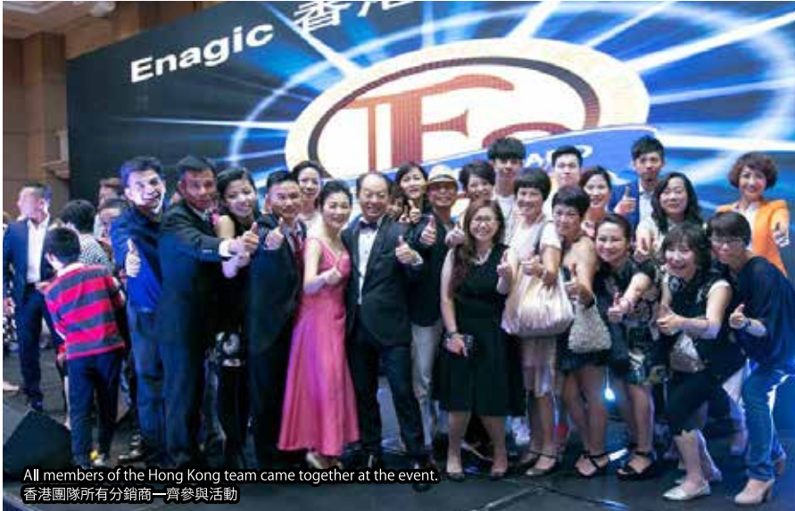
All members of the Hong Kong team came together at the event. 香港團隊所有分銷商一齊參與活動