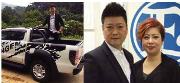
黑色與白色的Kangen皮卡車