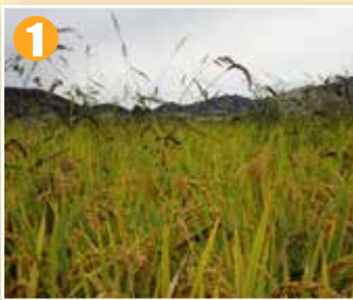
Most of the weeds found in the Kangen paddy are millets. 在「還原田」裡茂盛生長的小米，大多是比较高的小米

The milling and packaging company, Kuriya (Kagawa Prefecture), is a long-established company that has been in business for 134 years. The Kangen Rice is milled, screened, weighed, packaged and vacuum-sealed there before reaching the consumers. In fact, Kuriya is so thorough in their sanitation management that they also use electrolyzed water in the process of sanitizing and disinfecting the facility (photo ④). The Kangen Rice created by the “electrolyzed water trio” of Ido Agriculture (production), Kuriya (milling and packaging) and the maker of electrolyzed water generators, Enagic (sales), will be available for sale around the world starting this year.