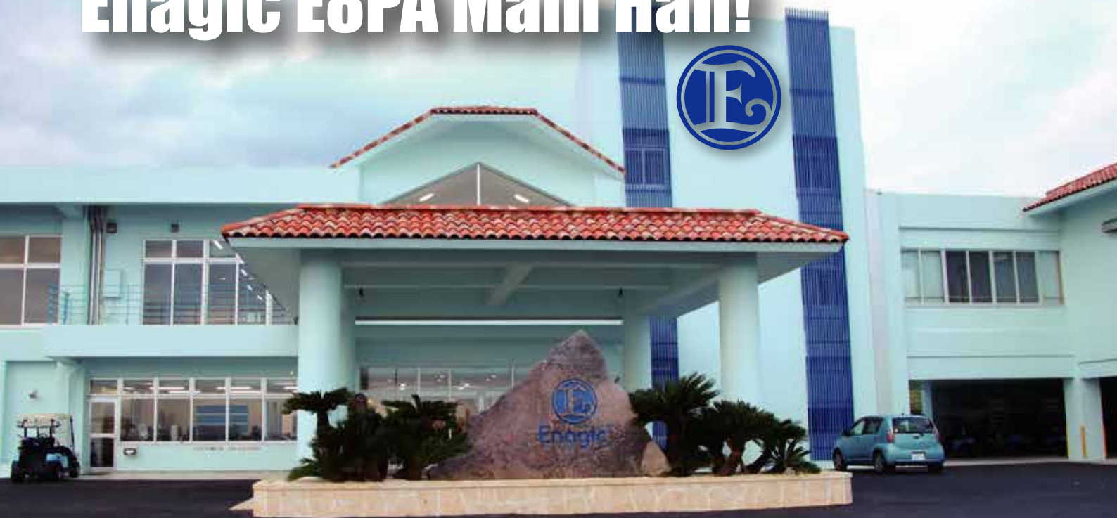
The facility, colored in Enagic blue.

Enagic E8PA Main Hall is the core building of the resort located on the premises of Enagic Sedake Country Club in Sedake, Nago City. The Hall has various facilities including lodging, restaurant, café, kitchen, archive room, shop for Enagic related goods and even a gallery that displays the photos of 6A2-3 distributors. The facility is ideal for holding seminars and training sessions or even just for relaxing, as it also provides a large bath hall.