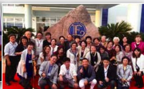
沖繩的石井團隊的成員也參加活動