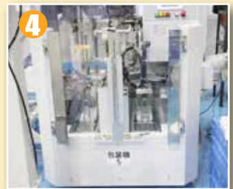
A test result of “undetected” fills up the report made by the Environmental Research Center. 『環境研究中心』的檢查結果為農藥「無檢出」

終於進入最後收成的階段。在收割之前，一般的農田和井戶農產的電解水稻作的農田比較看看。上面圖片的①是還原農田，②是一般農田。可以明顯地看到，圖①有但圖②沒有的「雜草」（比較高的植物為「小米」），非常茂盛的生長著。一般農田使用了大量的農藥、化學肥料，自然而然的雜草無法生存。還原田正好相反。雜草茂盛的還原田的電解水稻作，正是個安心安全的證明。