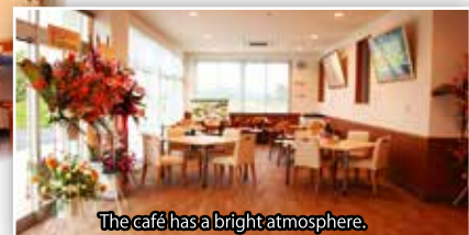
The café has a bright atmosphere.