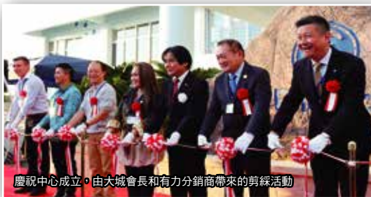
慶祝中心成立，由大城會長和有力分銷商帶來的剪綵活動