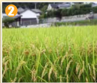
No weeds can be found in the normal paddy using agrochemicals. 使用農藥，完全看不到雜草的「一般田」