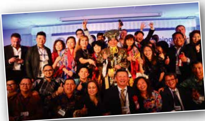
在活動結束之後，包圍著大城會長夫婦的海外分銷商