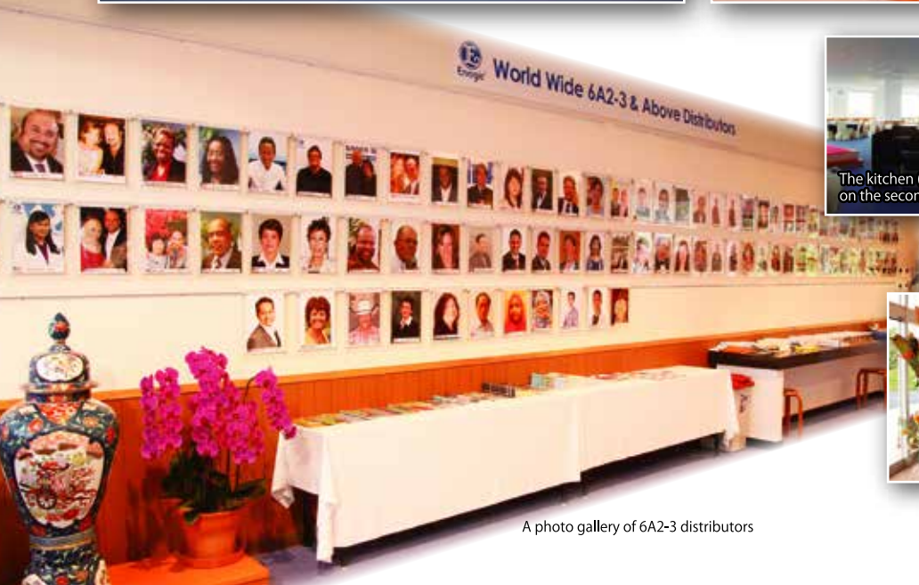
A photo gallery of 6A2-3 distributors