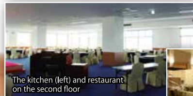
The kitchen (left) and restaurant on the second floor