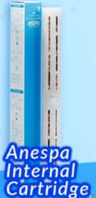
Anespa Internal Cartridge