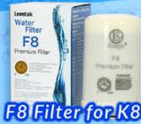
F8 Filter for-K8