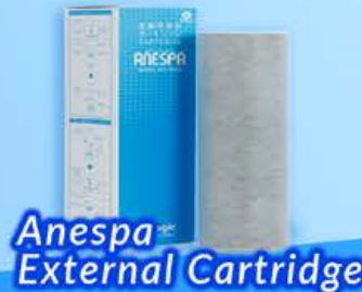
Anespa External Cartridge