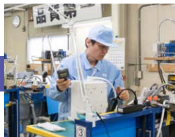
pH testing is also done during water flow testing on the completion line.