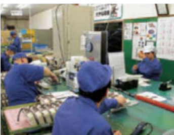
Electrolysis chamber assembly line. Global E-Friends 2022.10