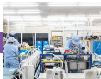
Main assembly line.