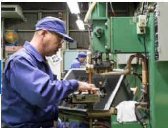
Press Processing Department for electrode plates.

The Osaka Factory is located in Hoshidakita, Katano City, in the northeastern part of Osaka prefecture. It is a large production facility covering over 43,000 square feet in both site area and overall floor space. The major components of our products, including everything from electrode plates to internal filters, are all made in our Osaka Factory. The factory adheres to the highest manufacturing standards and has earned numerous International Organization of Standardization (ISO) certifications, including ISO9001, ISO14001 and ISO13485.