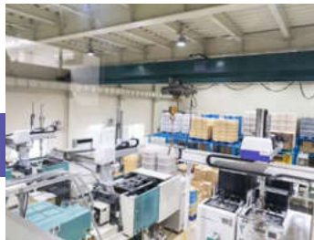
The latest injection molding machines.