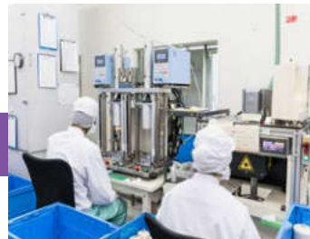
Production Department for cartridges.